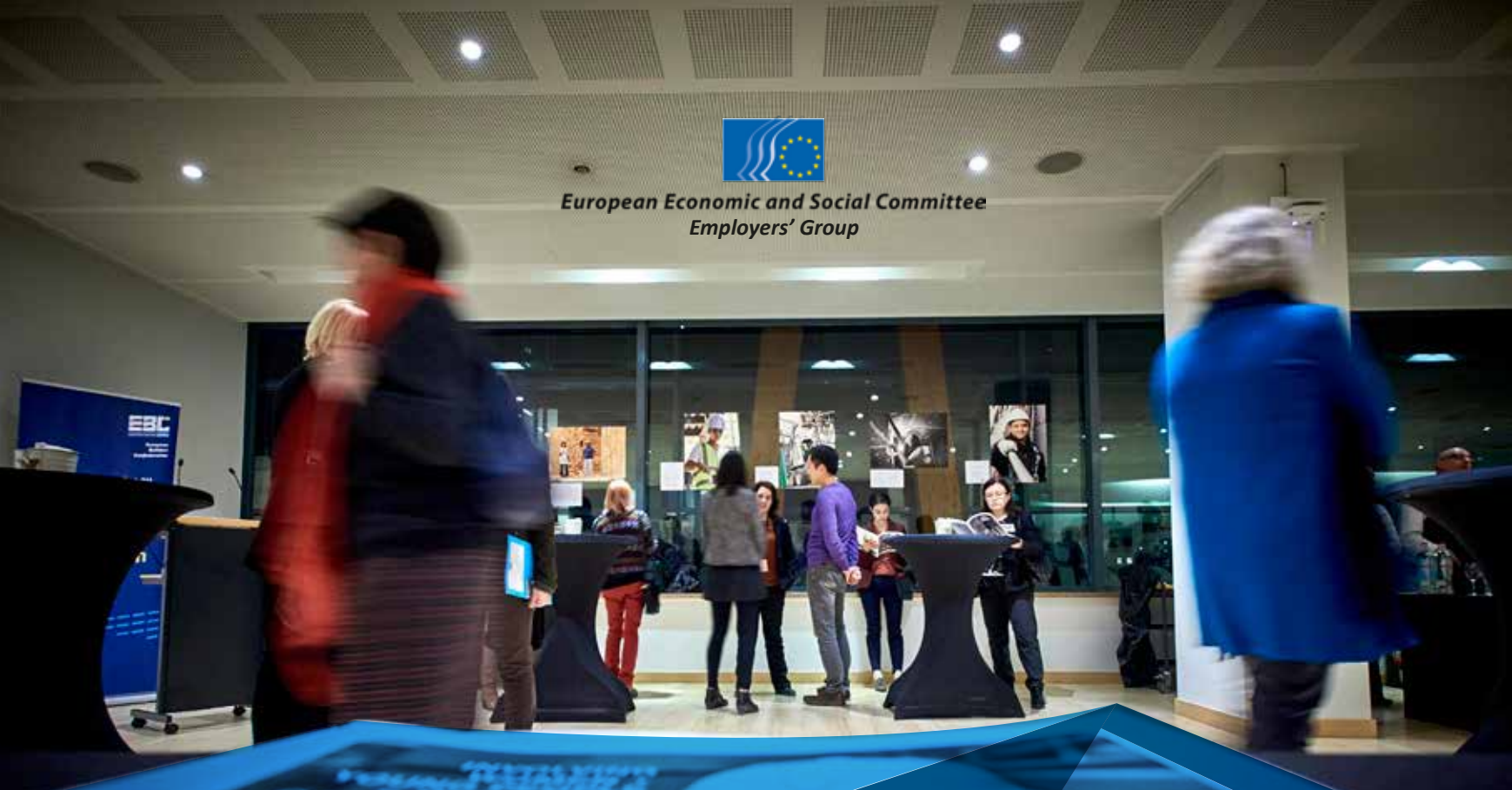
PHOTO EXHIBITION IN THE EUROPEAN ECONOMIC AND SOCIAL COMMITTEE ORGANISED BY EBC

"Portraits of women and young people in construction" - Brussels, February 2016